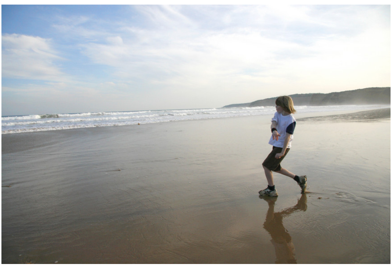
(Torquay - Photograph by Andrew Paoli - courtesy of Tourism of Victoria)

Australia has many famous beaches. Some of the most famous beaches include Bondi Beach and Manly Beach in Sydney, Cottesloe Beach and Scarborough Beach in Perth, Bells Beach in Victoria and Surfers Paradise Beach in Queensland. But there are so many more, too many to mention.