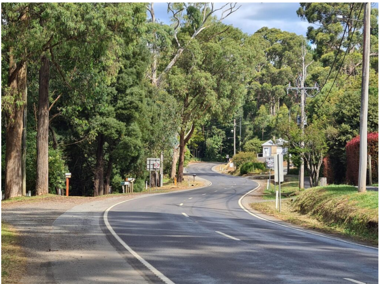
The main street of the small village of Toolangi.

When I reach the turnoff, I turn left and head towards Healesville. On the way I pass through a small village called Toolangi, which has a population of 344 people.