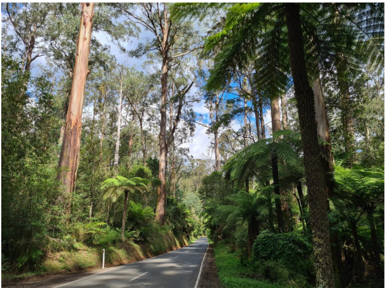
The forest and the ferns on the way from Toolangi to Healesville.

From Toolangi to Healesville, there is only 17 kilometres left to get to Healesville, but this stretch of road is probably my favourite motorcycling road in Victoria. It is my favourite road for two reasons. Firstly, it goes through a very beautiful forest, with huge trees and very large ferns which grow right up to the edge of the road. It is a delight. Secondly, the road has lots of corners and nearly all the corners have plenty of positive camber or slope, which means that a motorcycle can go around each corner at a reasonable speed in a safe fashion.