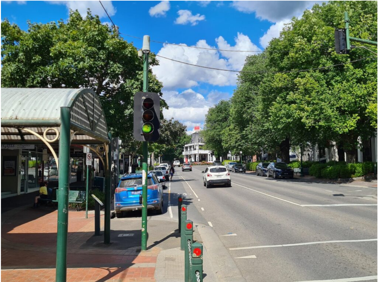
The main street of Healesville.

A visit to the town allows Melburnians a chance to get away from the hustle and bustle of the city and enjoy the unhurried atmosphere of the main street with its wide footpaths and indoor and outdoor café seating. I must admit however, that on public holidays or weekends, there are generally too many people there for my liking and some of that relaxed country atmosphere is lost. However, on weekdays it is a different story with few people other than the locals and relatively little traffic to disturb the laid-back feeling of the town. That's when I like to visit Healesville.