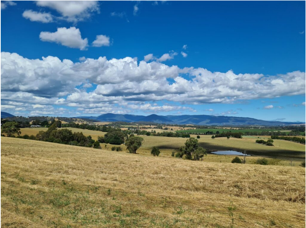
The view towards the Dandenong Ranges from outside Healesville.

These ranges are not really a mountain range in the normal sense, as they are not very high, with the highest peak being around 630m. However, they are very well-wooded with a variety of trees and plants and are a delight to ride or drive through. I suspect that they help to keep the town a bit cooler on the hotter days.