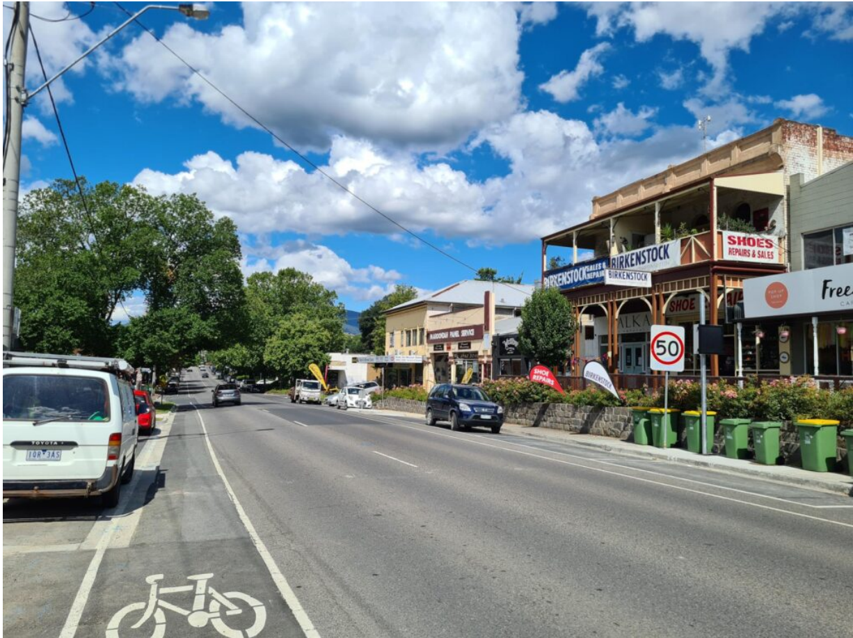
The main street of Healesville.

Healesville has other things to see besides the cafes and restaurants. It has the famous Healesville Sanctuary, which is a zoo of native Australian animals. That's where I saw my first (and only) platypus. We took our children there a few times when they were young, as the zoo is excellent for learning about, and seeing, native Australian animals in their natural environment. There you will see kangaroos, koalas, birds, platypuses, snakes and all sorts of native Australian animals. The staff are very knowledgeable and you can learn so much. If ever you visit Melbourne, a trip to the Healesville Sanctuary is well worth it. By car it is just about 1 hour and 15 minutes away from the city.