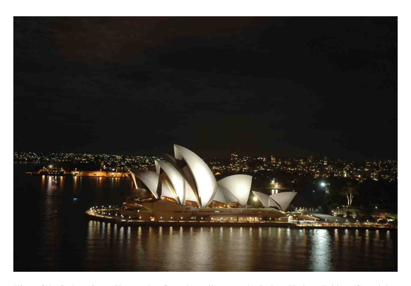
View of the Sydney Opera House taken from the walkway on the Sydney Harbour Bridge.